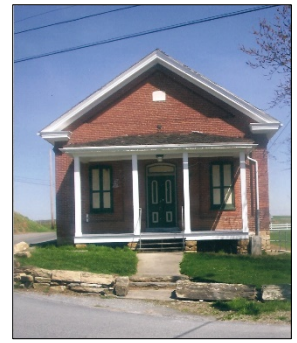
Walnut Run School