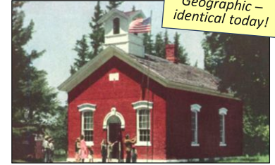
OVERACKERS CORNERS SCHOOLHOUSE