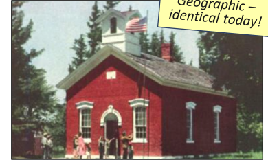
OVERACKERS CORNERS SCHOOLHOUSE